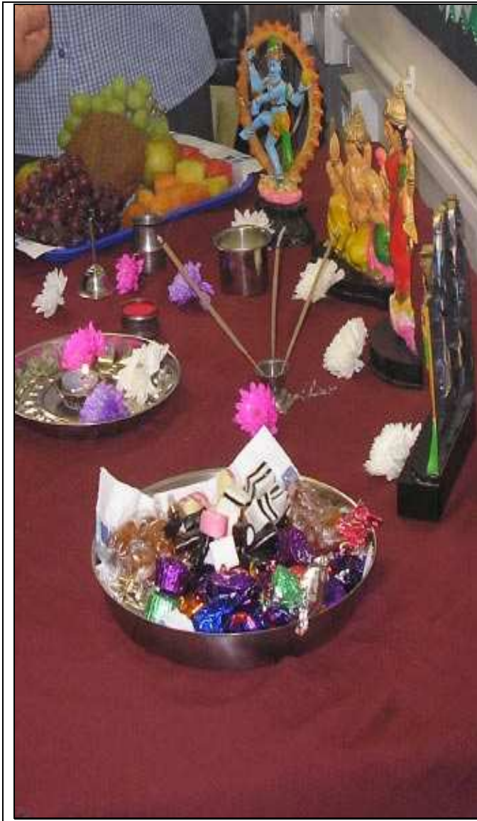
Preparation for a Hindu Arti festival